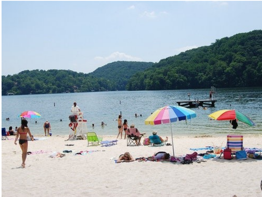
CLAYTOR LAKE STATE PARK