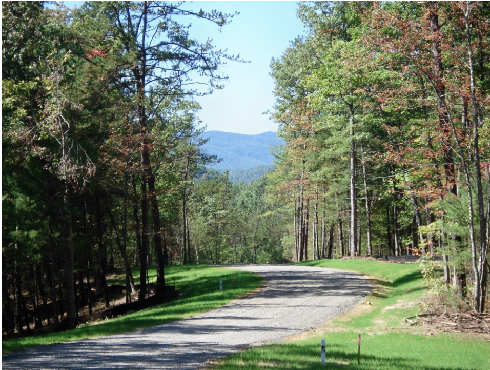
LUSH NATURAL LANDSCAPE