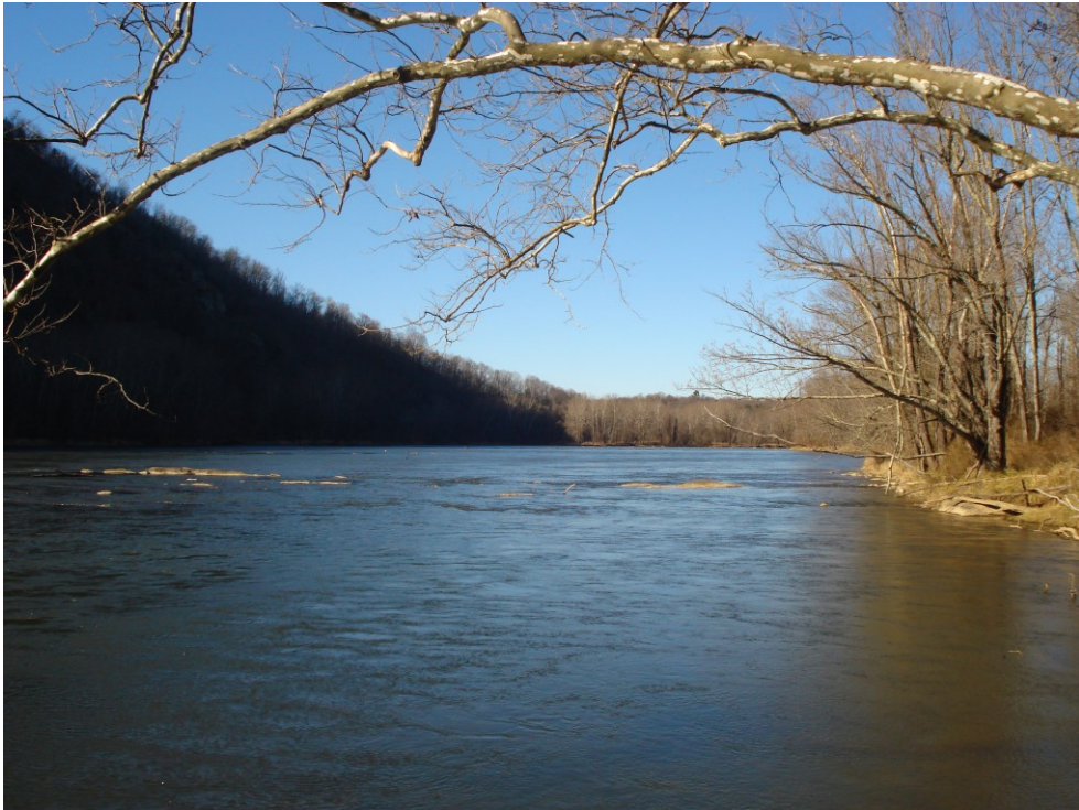
NEW RIVER JUST MINUTES AWAY