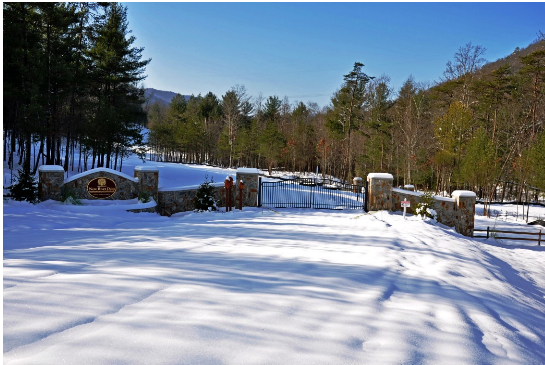
SECURE GATED ENTRY